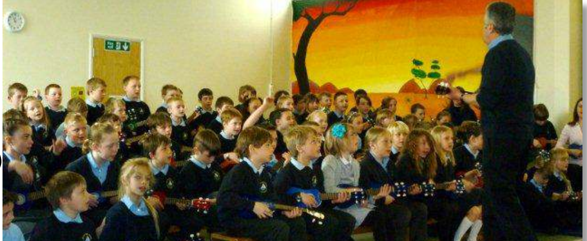
Pupils of Lee Junior School with Ukelele Junction featuring on BBCtv South Today (transmitted 29 March 2011)

Concert with Audience Participation As seen on BBC tv South Today